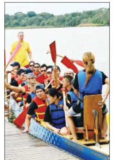
THE FACOST team prepares to race at the Gulf Coast International Regatta on Oct. 23, 2004.